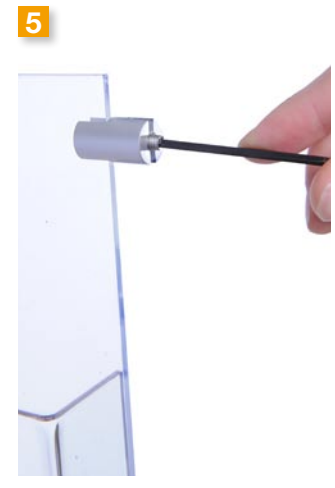
Remove the side screws in all grip connectors.