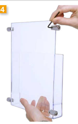
Attach the four identical grip connec-

Screw the bottom fitting of the wire assembly into the connector until the wire is tight. Repeat the process with the top fitting.