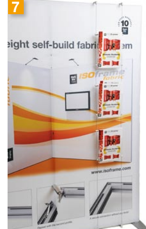
You can now attach more brochure pockets.