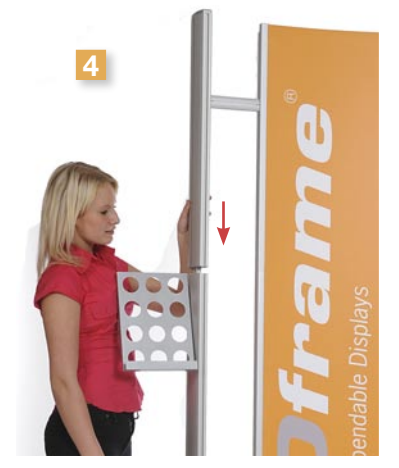
Attach the top oval post