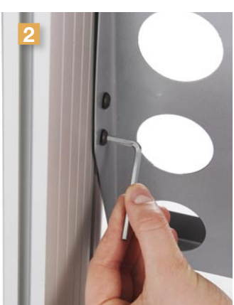
Lock the screws with the allen key