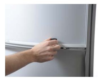
Lock the screws at the reverse side of the graphic panel.