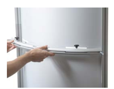
Attach the beam in front of the cut out you have done in the graphic panel.