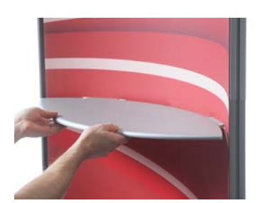
Push in the shelf in the cut out you have done in the graphic panel (dee below).